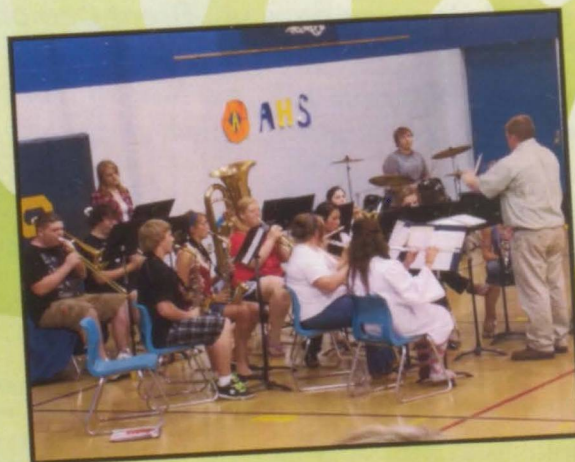
*MUSIC PLEASE* The Senior band members' last performance.